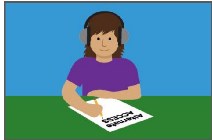
WIDA Alternate ACCESS