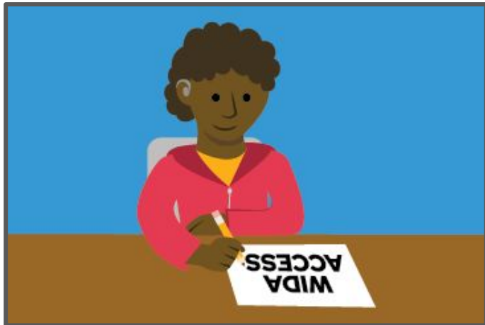
WIDA ACCESS Paper