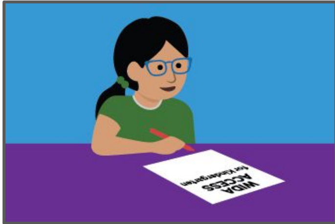
WIDA ACCESS for Kindergarten