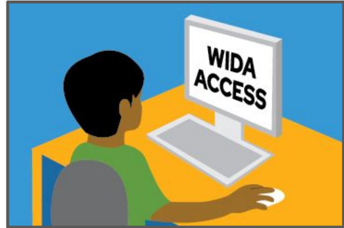
WIDA ACCESS Online